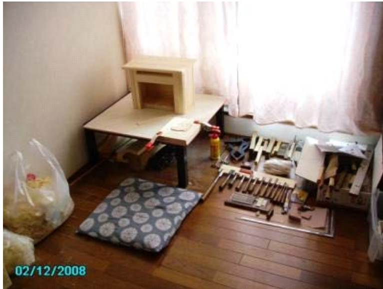
Photo of the 36 Square Feet Shop

I would recommend going for 10x18 if you do have more than 36 square feet of space.