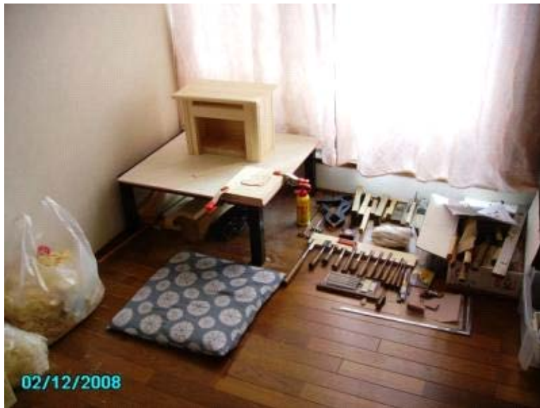
Photo of the 36 Square Feet Shop

I would recommend going for 10x18 if you do have more than 36 square feet of space.